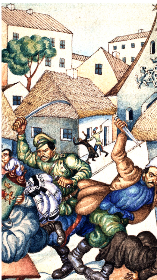
Arthur Szyk (1923)

"Should any of those murderers blasphemously allege religion as a pretext, we wish to be the first to brand them as lying hypocrites, enemies of Christ and blots on the human race."